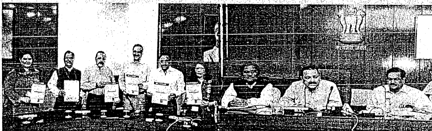
Hon'ble MoS(PP), Dr Jitendra Singh with the senior officers of DARPG and DoPT

The citizen can view the status any time - anywhere using the mobile App